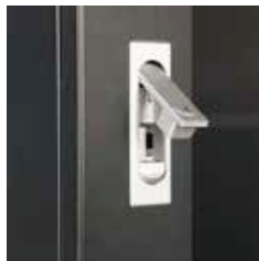
Advanced moon Shaped lock