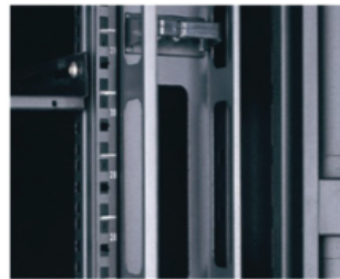
Cable manager with cap