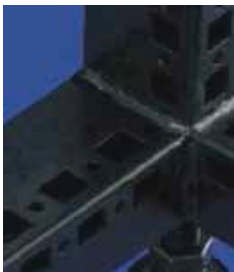
Welded frame with strong structure