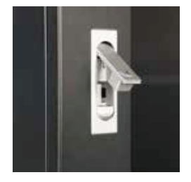
Advanced moon Shaped lock