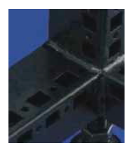
Welded frame with strong structure