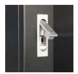
Advanced moon Shaped lock