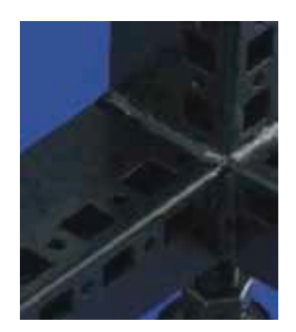
Welded frame with strong structure